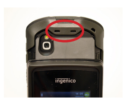
Ensure that the rubber exoskeleton on the Zebra device, hooks over the tabs on the case.