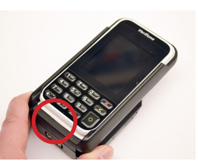
Ensure that the E285 is fully seated on the USB-C connector.

Slide the Verifone E285 into the side of the case with the USB-C connector.